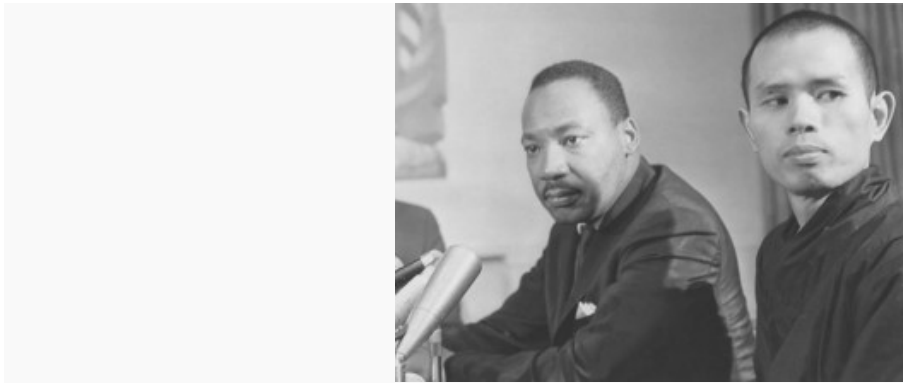
Martin Luther King Jr. & Thich Nhat Hanh

A few months later he travelled once more to the U.S. and Europe to make the case for peace and to call for an end to hostilities in Vietnam. It was during this 1966 trip that he first met Dr. Martin Luther King Jr., who nominated him for the Nobel Peace Prize in 1967. Yet as a result of this mission both North and South Vietnam denied him the right to return to Vietnam, and he began a long exile of 39 years.