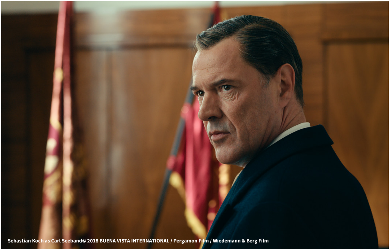
Sebastian Koch as Carl Seeband

Koch appeared together with Bruce Willis in John Moore's A GOOD DAY TO DIE HARD (2013) and for Ridley Scott in his American pilot THE VATICAN (2014).