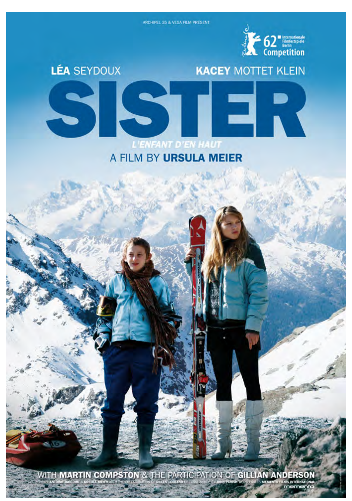
VANAF 8 NOVEMBER IN DE BIOSCOOP