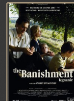
THE BANISHMENT 2007