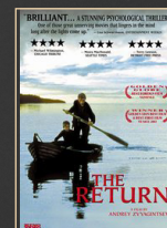
THE RETURN 2003