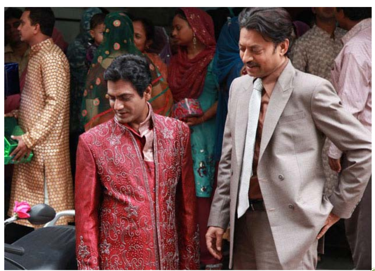
Durée 104min. / Langue: hindi / Pays: Inde